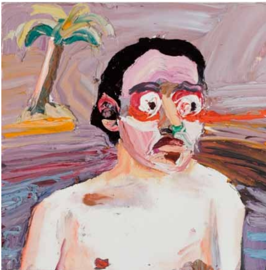
Ben Quilty The Guest , 2012 oil on linen 45 x 45 cm