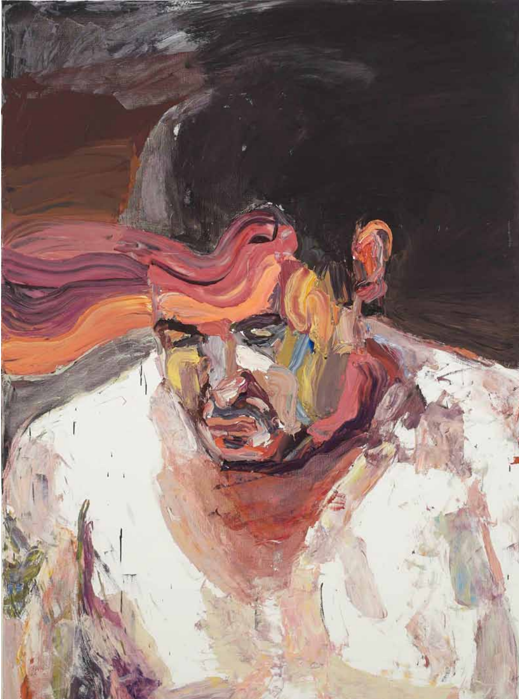
Ben Quilty Troy Park After Afghanistan, 2012 oil on linen 190 x 140 cm

Ben Quilty After Afghanistan Australian War Memorial Touring Exhibition 2013 - 2015