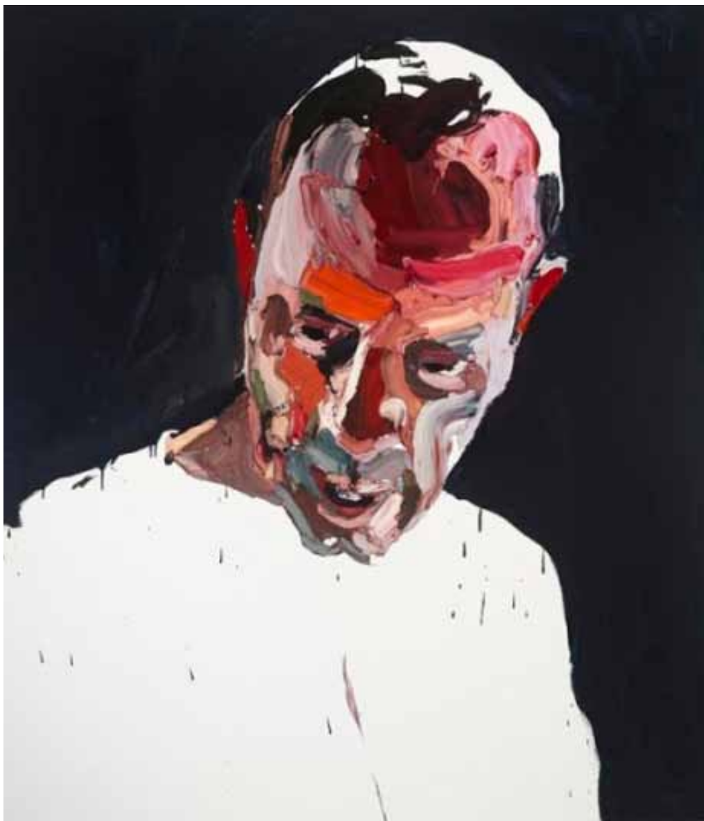
Ben Quilty The Evo Project No. 8 , 2011 oil on linen 170 x 150 cm