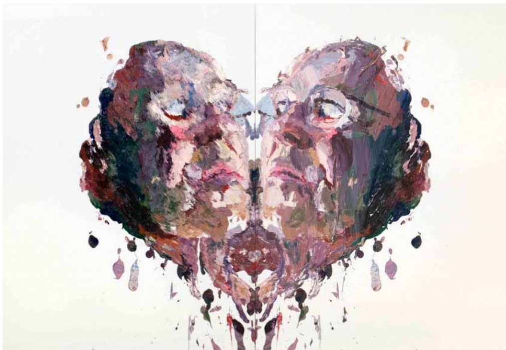
Ben Quilty Greer Rorschach No. 6 , 2010 oil on linen two panels, 190 x 140 cm, each