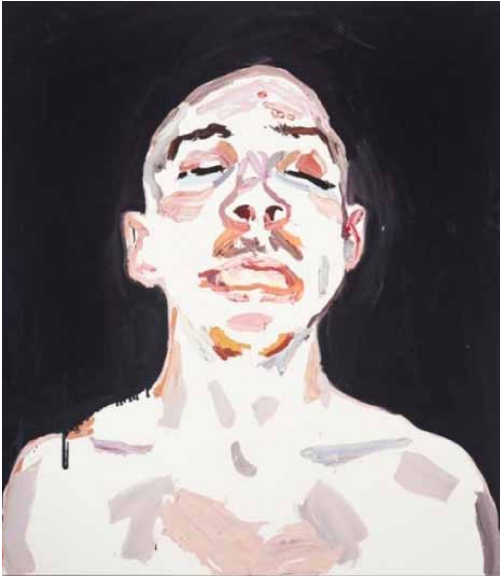
Ben Quilty The Evo Project No. 4 , 2011 oil on linen 170 x 150 cm