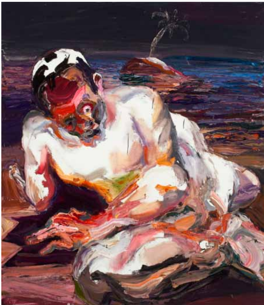
Ben Quilty Survivor , 2012 oil on linen 170 x 160 cm