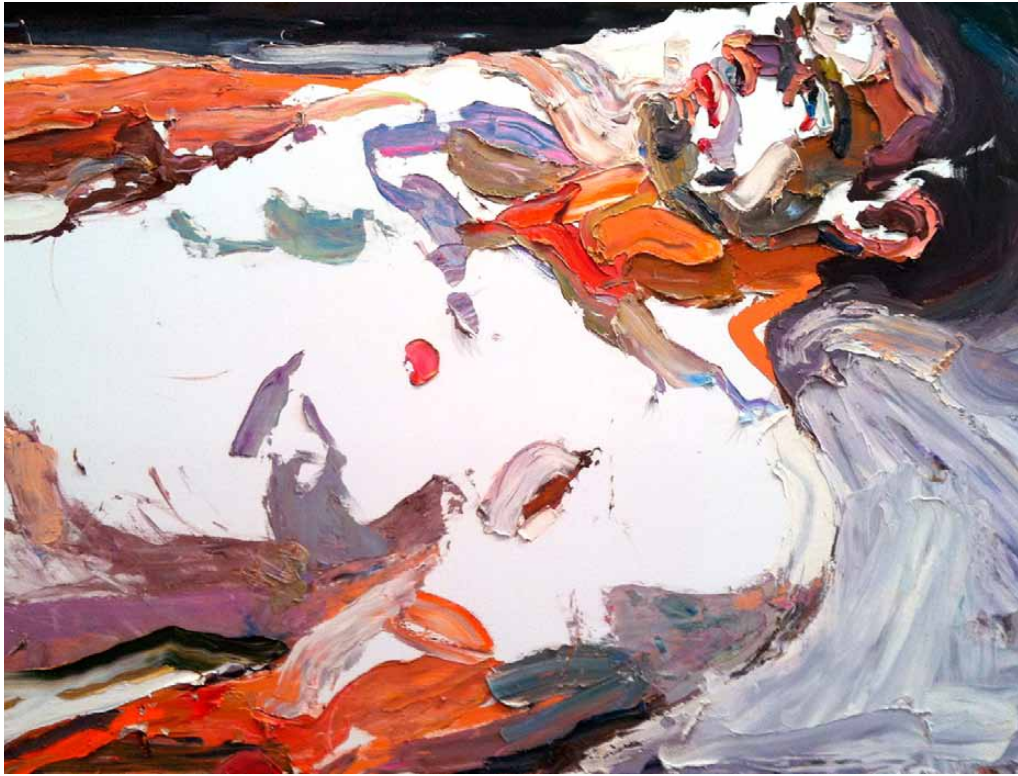
Ben Quilty Captain S, After Afghanistan , 2012 oil on linen 140 x 190 cm

Ben Quilty After Afghanistan Australian War Memorial Touring Exhibition 2013 - 2015