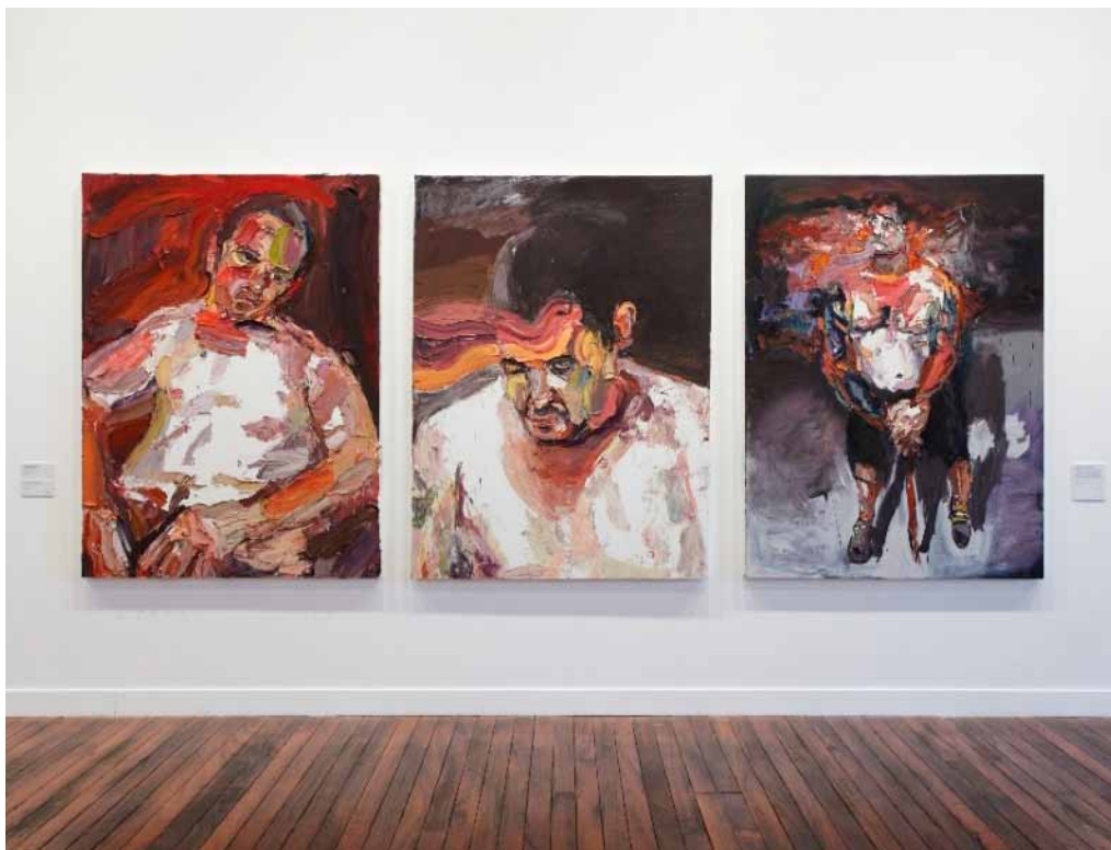
Ben Quilty Ben Quilty After Afghanistan National Art School Sydney, 2013