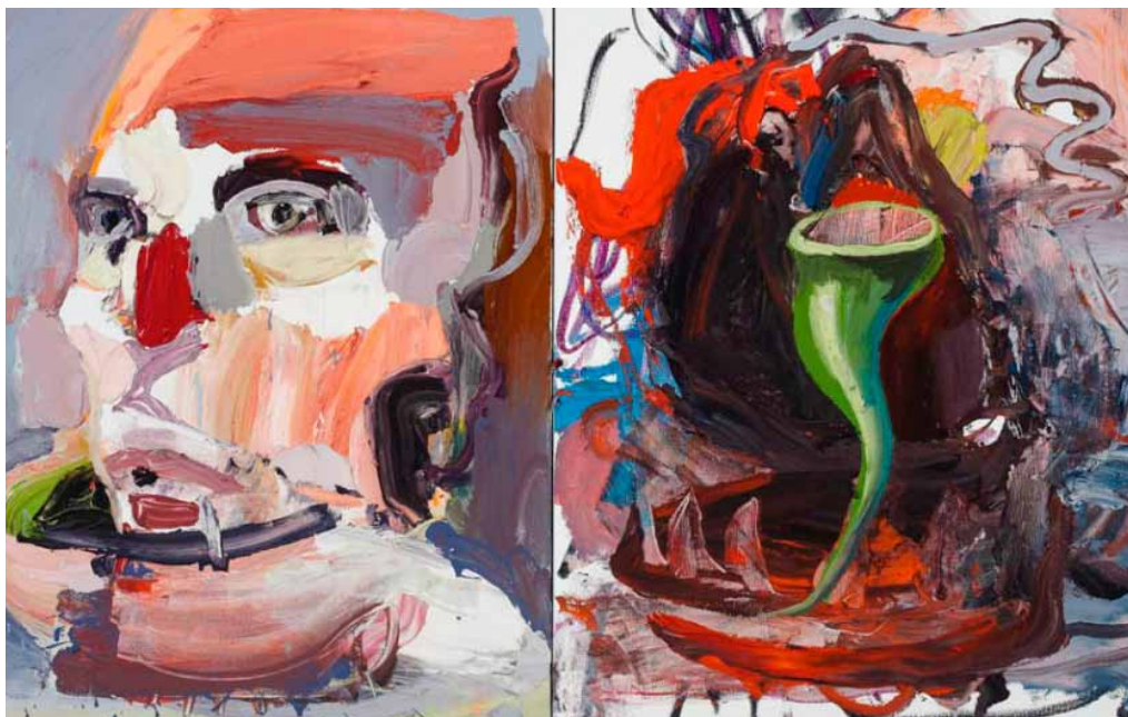
Ben Quilty The Space In Between No. 2 , 2011 oil on linen two panels, 100 x 80,5 cm, each