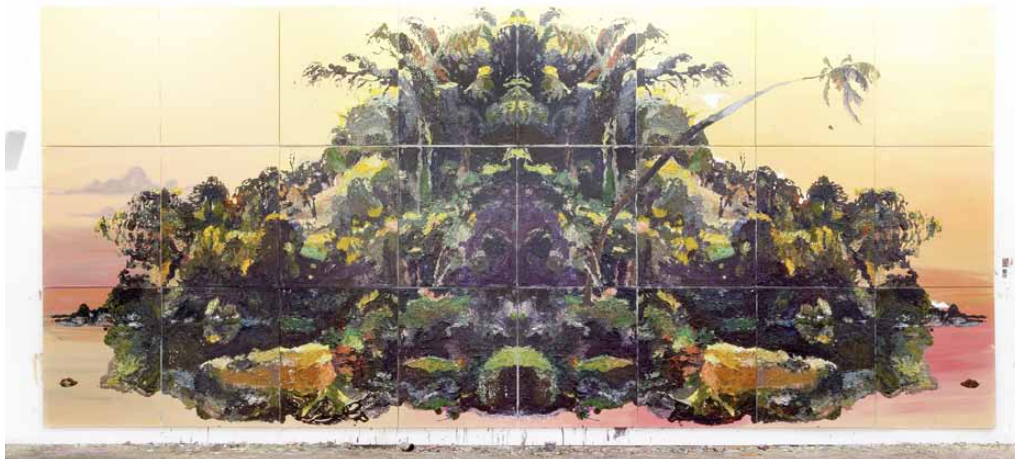
Ben Quilty The Island , 2014 oil and acrylic on linen 24 panels 390 x 880 cm overall