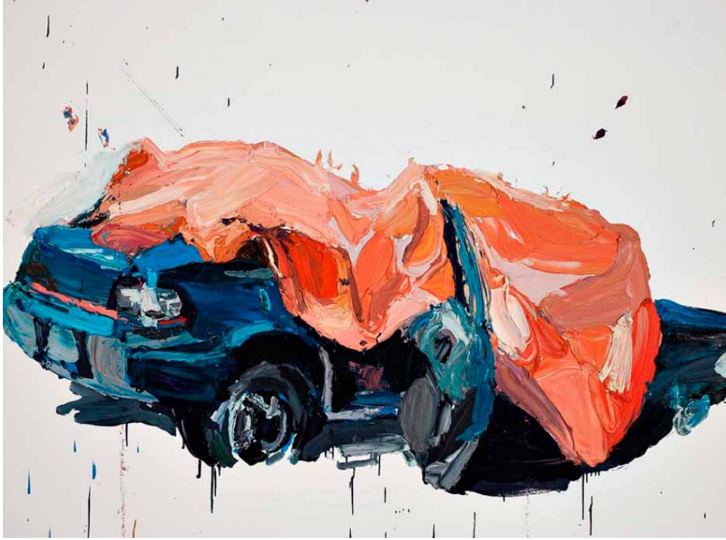
Ben Quilty Crash Painting , 2009 oil on linen 140 x 190 cm