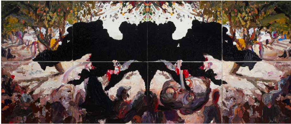
Ben Quilty Kuta Rorschach , 2014 oil on linen 8 panels, 220 x 520cm overall