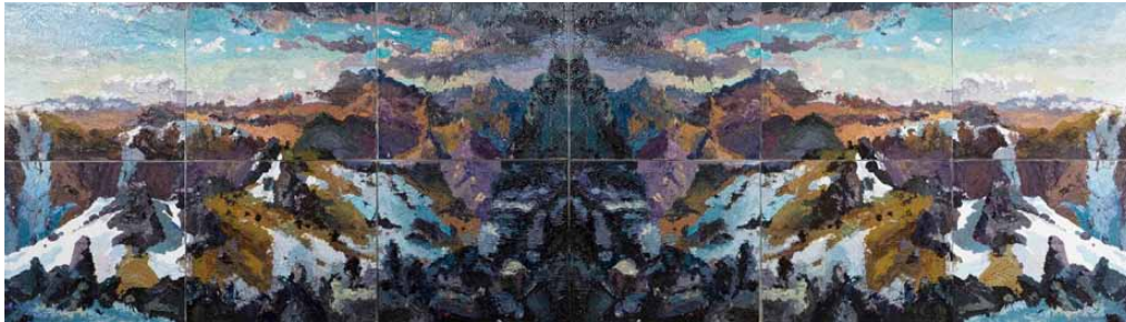
Ben Quilty Kuta Rorschach , 2014 oil on linen 8 panels, 220 x 520cm overall