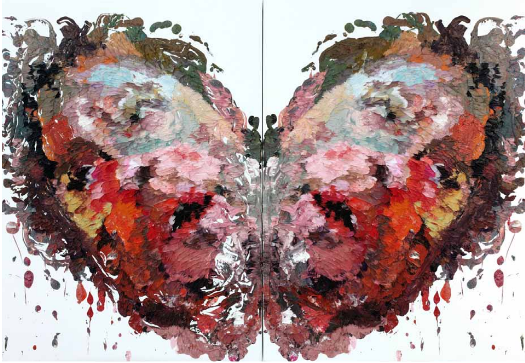
Ben Quilty Smashed Rorschach , 2009 Oil on linen 140 x 190 cm