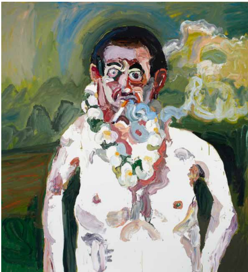
Ben Quilty The Groom , 2012 Oil on linen 180 x 170 cm