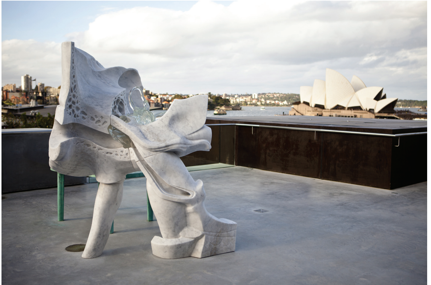
Hany Armanious Fountain (exhibition view Campbelltown Art Center, Museum of Contemporary Art, Sydney), 2012 marble, cast polyurethane resin, bronze 213 x 183 x 271 cm