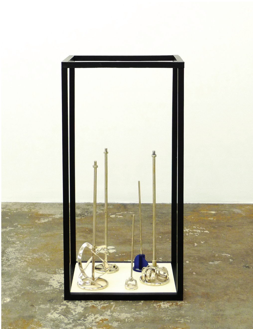
Hany Armanious Lighthouse , 2013 cast pigmented, polyurethane resin, sterling silver 100 × 50 × 40 cm Courtesy of Michael Lett, Auckland