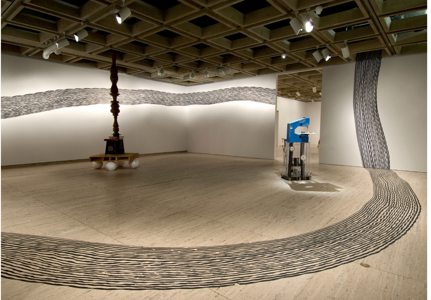
Hany Armanious River Dance, Adventures With Form In Space , Balnaves Foundation Sculpture Project, 2006 Various Media exhibition view, Art Gallery of New South Wales, Australia