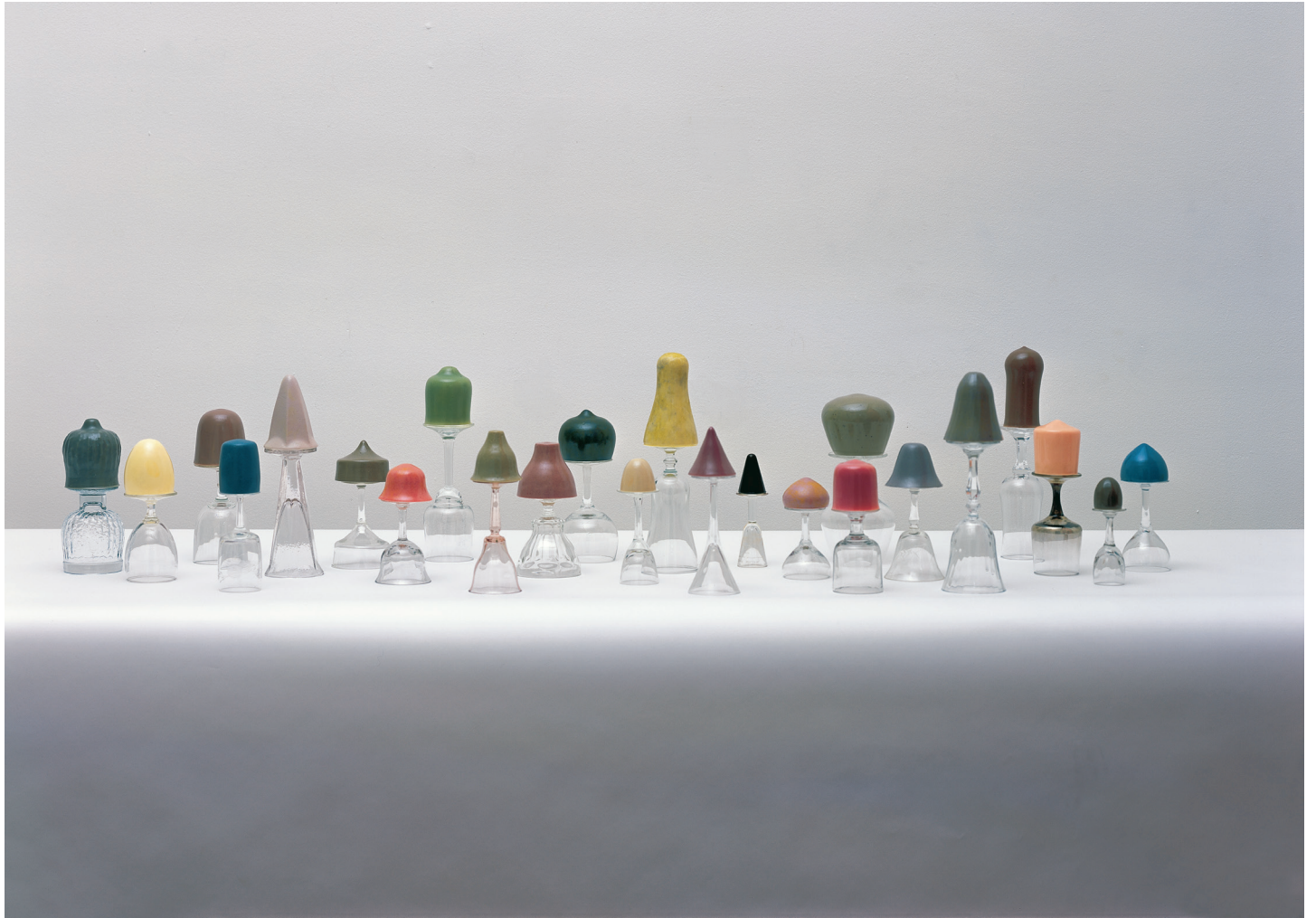
Hany Armanious Snake Oil , 2005 hotmelt, glass variable dimensions