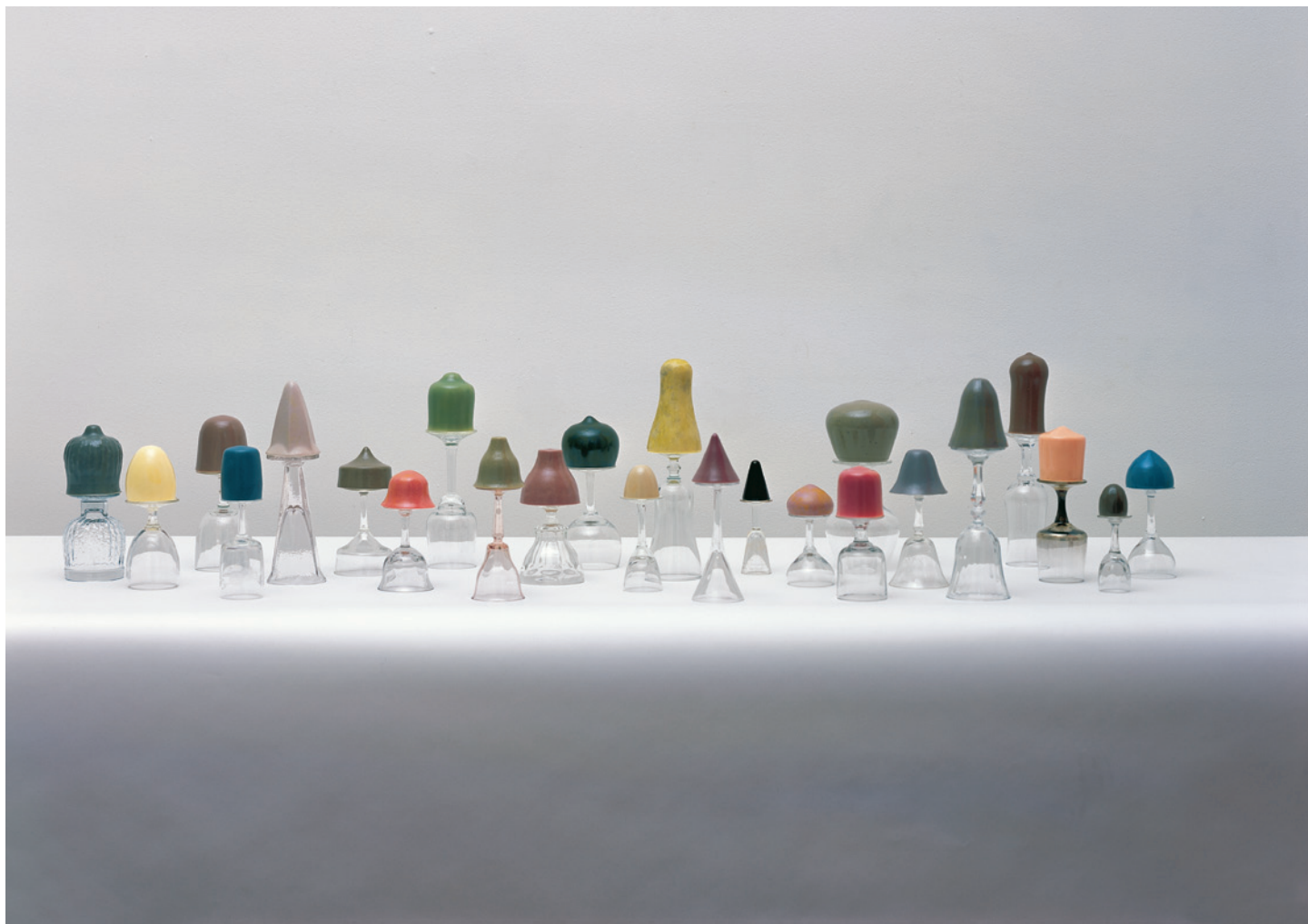
Hany Armanious Snake Oil , 2005 hotmelt, glass Dimensions variable