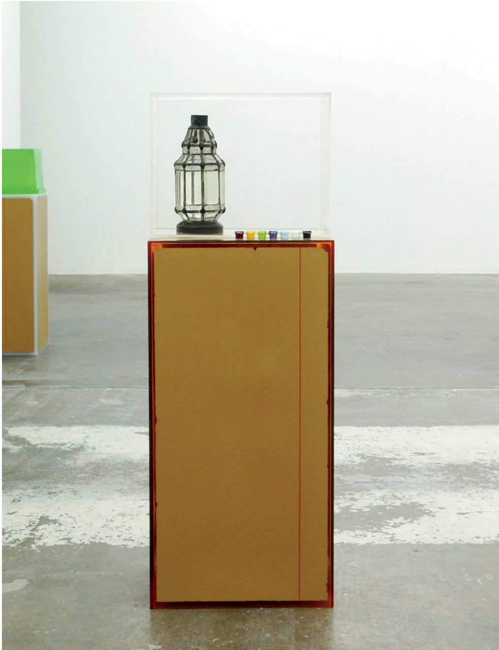
Hany Armanious Powermap , 2013 cast pigmented polyurethane resin. 140 × 50 × 40cm