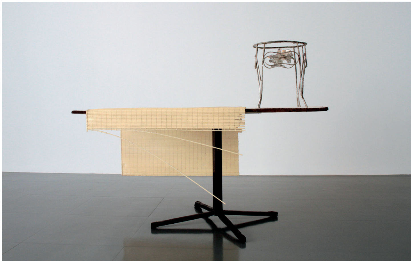
Hany Armanious True Romance , 2011 pigmented polyurethane resin and pewter 125 × 155 × 63cm