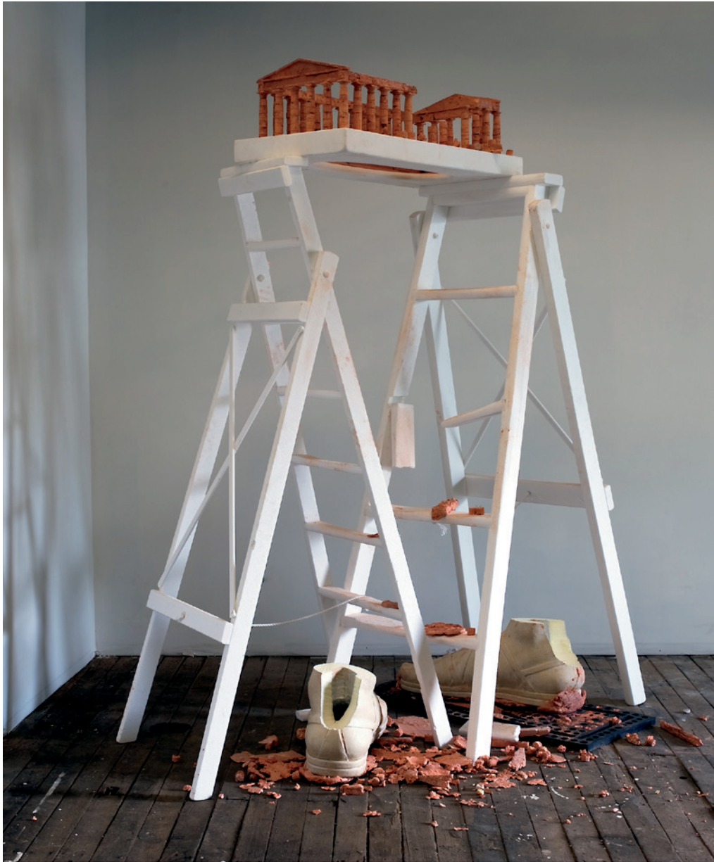
Hany Armanious Mystery Of The Plinth , 2010 polystyrene, polyurethane, epoxy, silicone, pigment 245 × 235 × 110cm