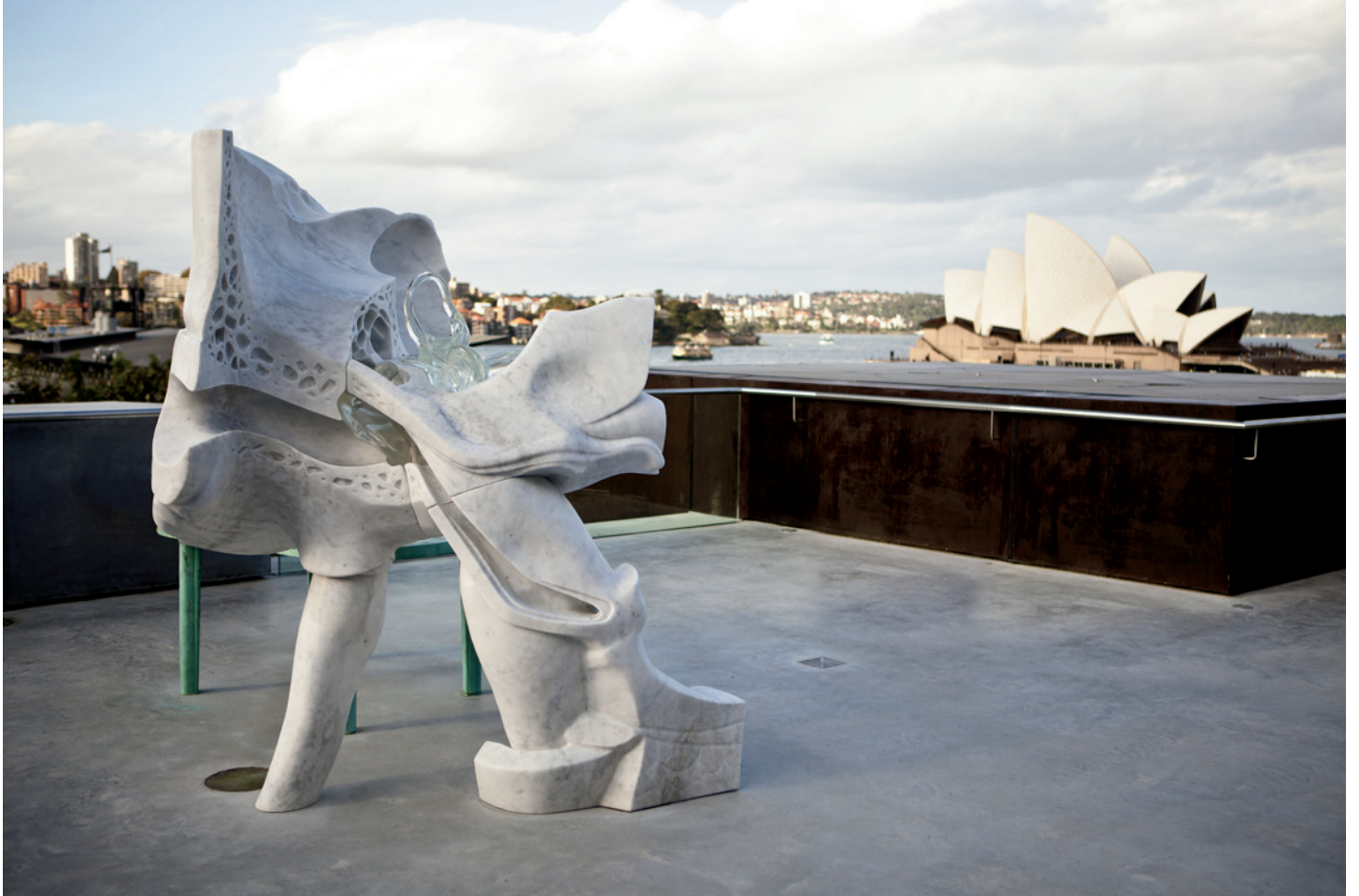
Hany Armanious Fountain , 2012 marble, cast polyurethane resin, bronze. Museum of Contemporary Art 213 x 183 x 271.