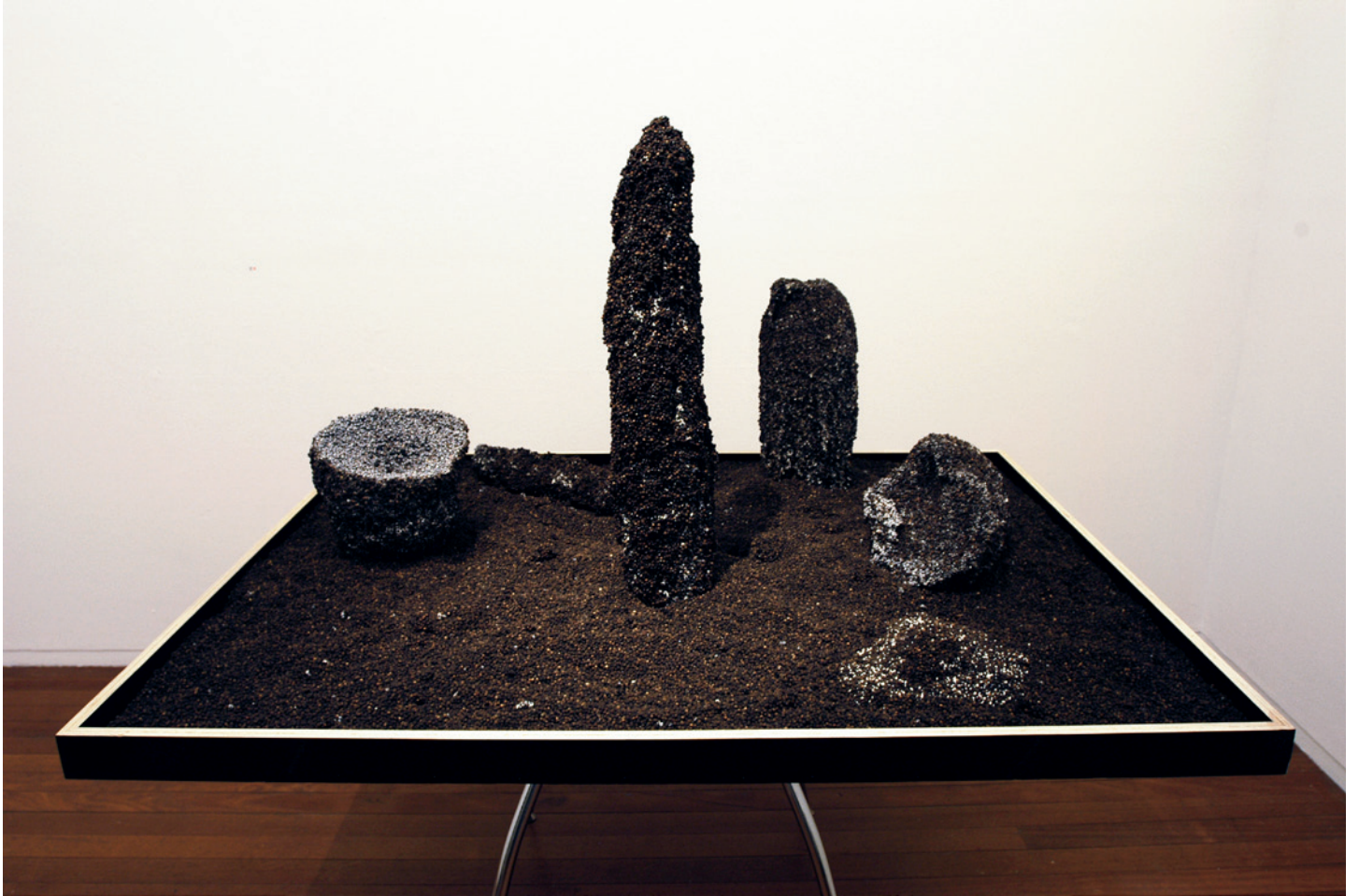
Hany Armanious Scaring Away the Human Form (Death as Adviser) , 2004 black peppercorns, polyurethane on form-ply and steel 150 × 143 × 110.5 cm