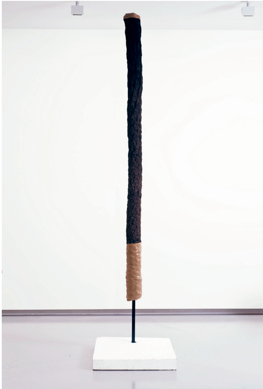
Hany Armanious Weeping Woman , 2012 cast pigmented polyurethane resin. Monash University Museum of Art, Melbourne. 318 × 71.5 × 86cm